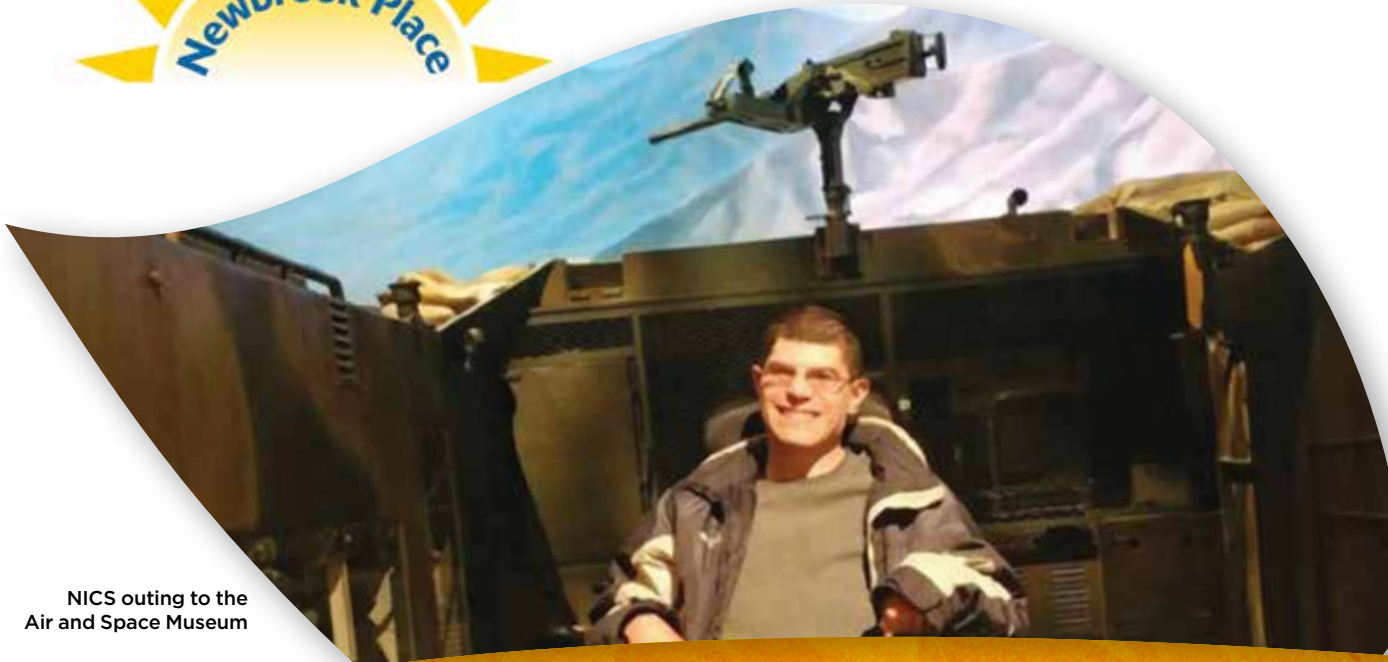
NICS outing to the Air and Space Museum